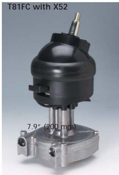
T81FC with X52