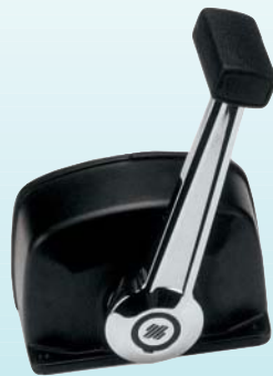
B73 B77 with trim