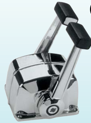
B66 B78 with trim