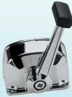
B65 B76 with trim