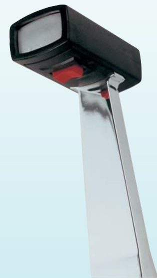
Handle with trim