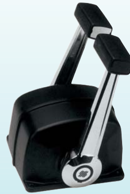
B74 B79 with trim