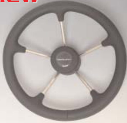
V70 Ø 13.8" (350 mm)