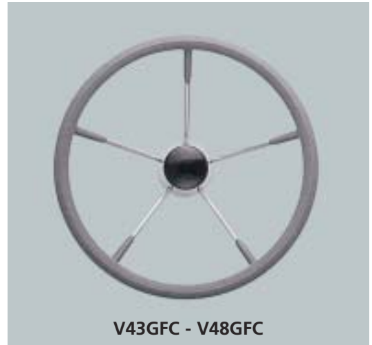
V43GFC - V48GFC