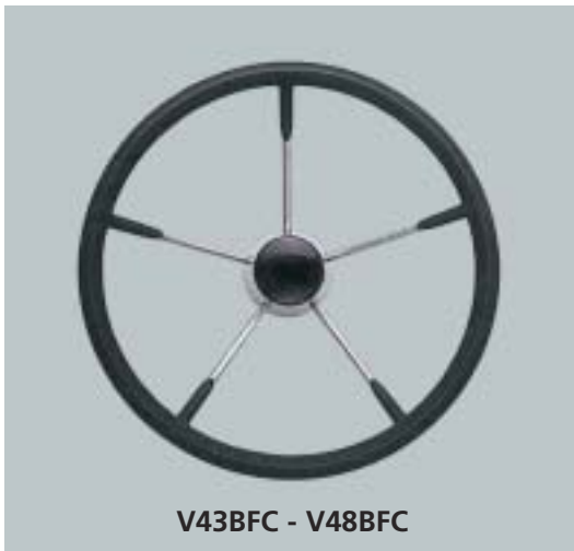
V43BFC - V48BFC