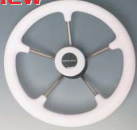
V70W Ø 13.8" (350 mm)