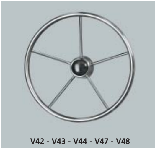
V42 - V43 - V44 - V47 - V48